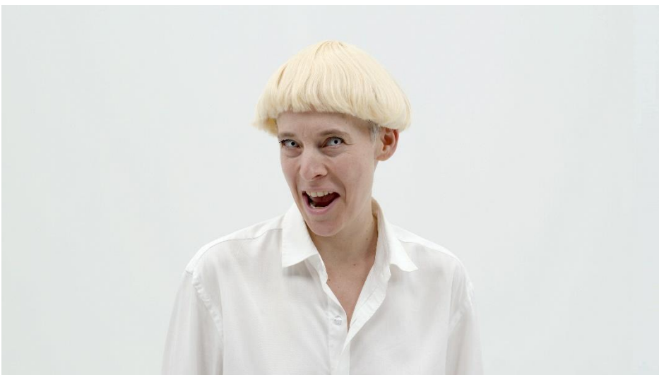
Candice Breitz, Whiteface , 2022, Commissioned by the Museum Folkwang