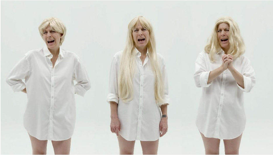
Candice Breitz, Whiteface , 2022, Commissioned by the Museum Folkwang © and courtesy the artist.