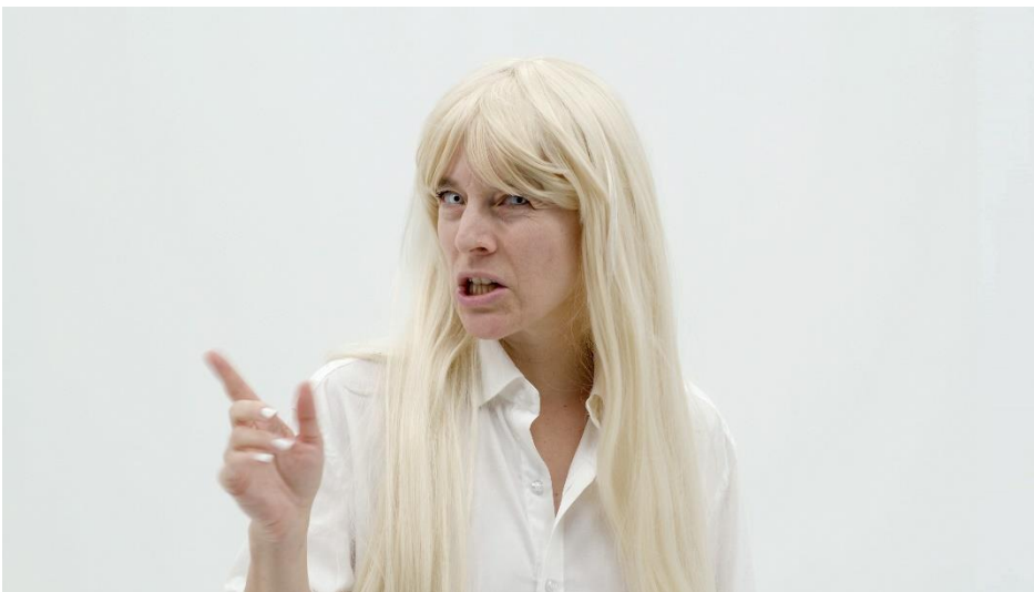
Candice Breitz, Whiteface , 2022, Commissioned by the Museum Folkwang © and courtesy the artist.

Please note: When using the images, they should not be cropped and must not be overwritten with text. The respective captions are mandatory. Please note in any case the © of the images.