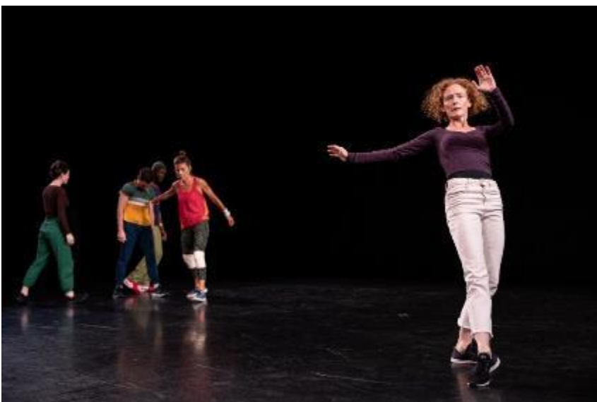
Yvonne Rainer, Hellzapoppin': What about the bees?.