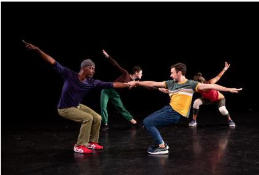
Yvonne Rainer, Hellzapoppin': What about the bees? .

Please note: When using the images, they should not be cropped and must not be overwritten with text. The respective captions are mandatory. Please note in any case the © of the images.